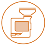
Indirect Flame (OPT)