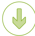
Low Energy Consumption