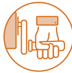
Safety Manual Crank