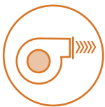
Full Modulation (OPT)