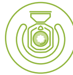
Pollution Free Ambient