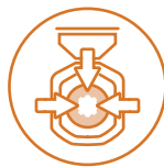
Sub-Atmospheric Combustion Chamber