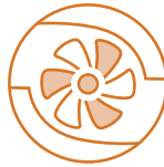
Blower Speed Control