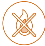
In Drum Extinguish